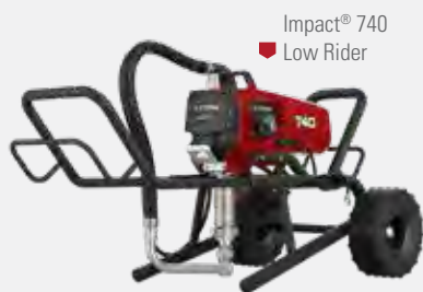
Impact® 740 Low Rider

The Impact 740 is designed for extended, heavy-duty performance on larger residential and commercial projects. This is the sprayer contractors turn to when the time comes to enter the big leagues.