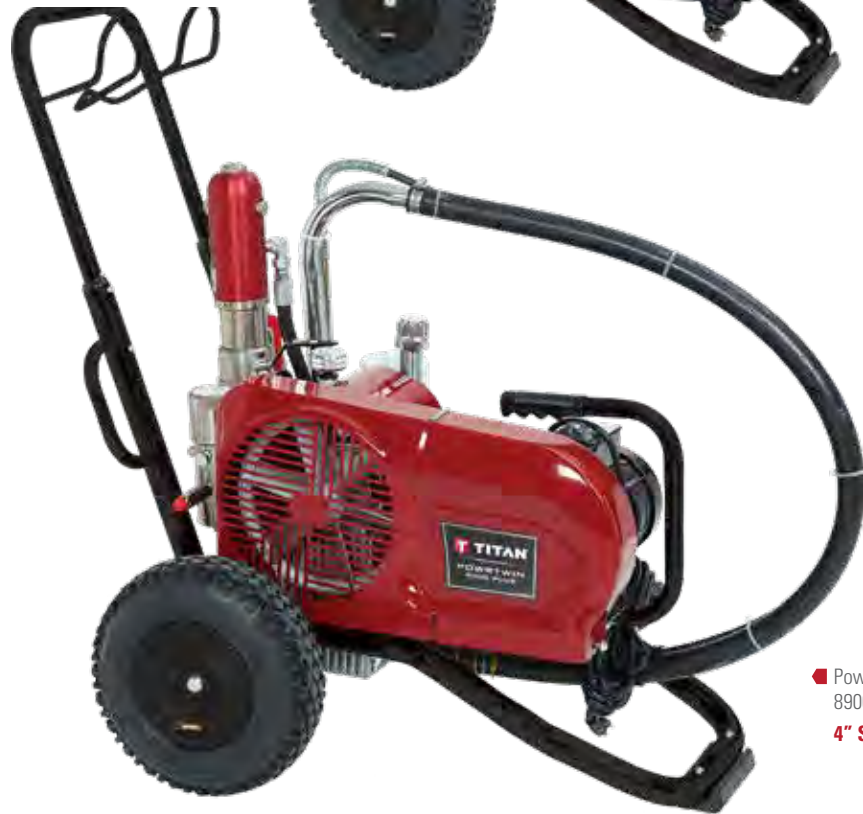
PowrTwin 8900 Plus 4" Stroke