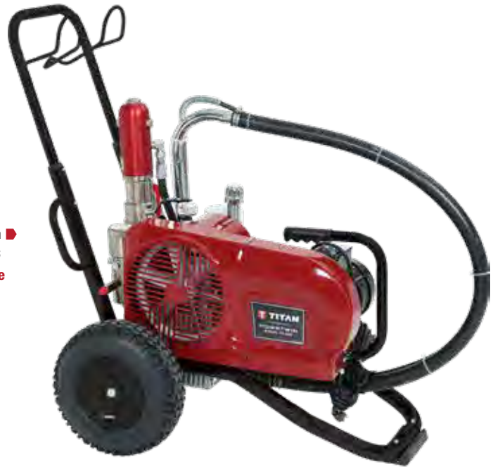
PowrTwin 6900 Plus 3" Stroke

The 8900 Plus comes with S-5 Gun, 517 TR1 Reversible Tip and 1/4" x 50' Airless Hose.