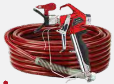
The Impact 640 comes with RX-Pro Gun, 517 TR 1 Reversible Tip and 1/4" x 50' Airless Hose.