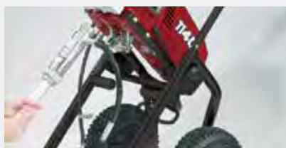
3. Pull handle under body. Slide out fluid section.