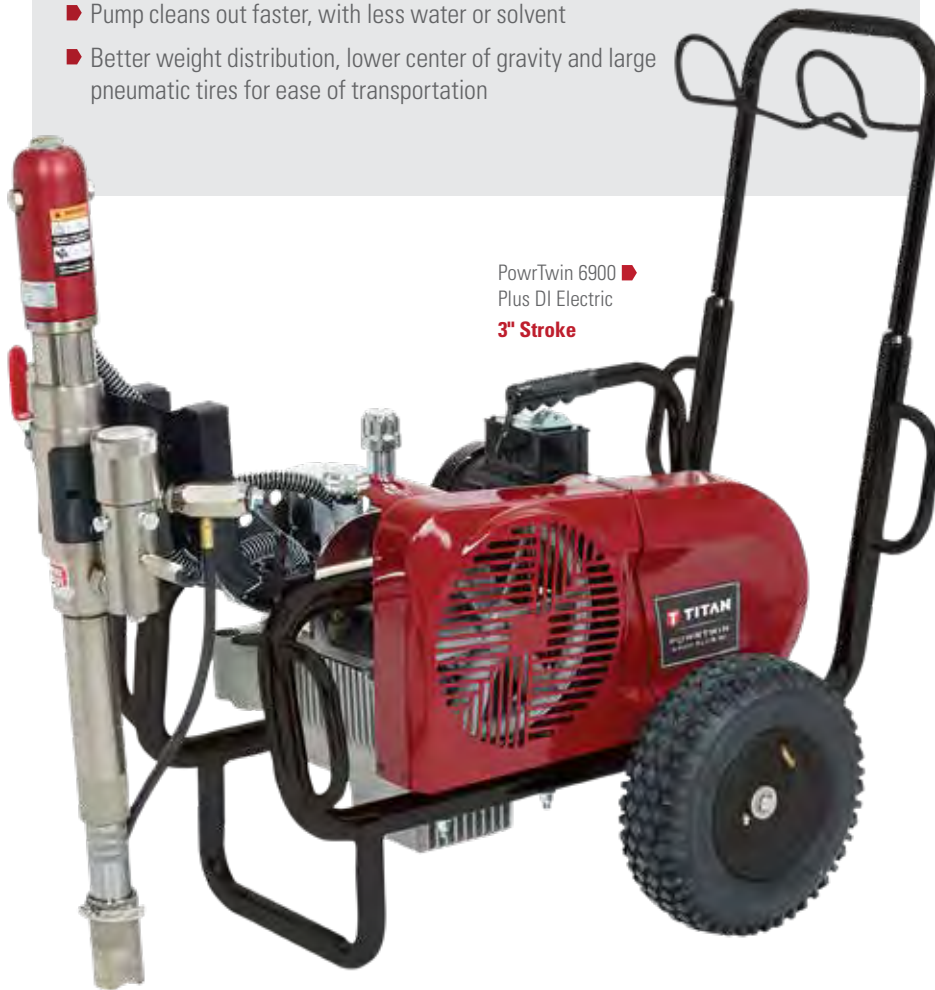
PowrTwin 6900 Plus DI Electric 3" Stroke