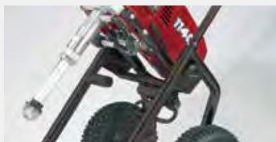
1. Tilt back.