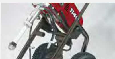
2. Detach quick release hoses.