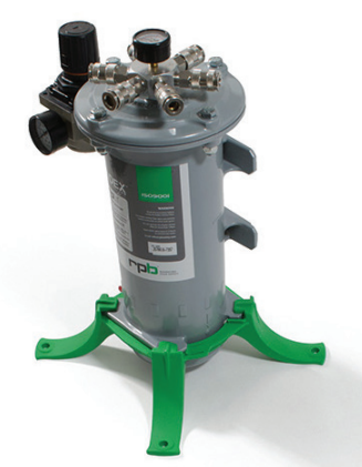
RPB Radex® Airline Filters