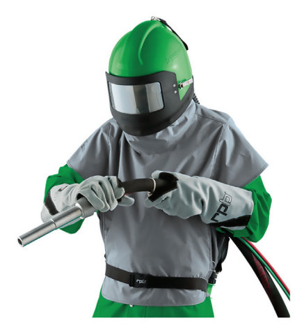
RPB Nova 2000™ Blasting Helmet