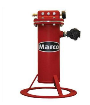
Barricade® 286-Series Airline Filters

Marco offers a wide variety of airline filters from manufacturers including Marco, Bullard®, RPB®, and Clemco. Airline filters remove particulates like oil, odor, and organic vapors from compressed air before delivery to a supplied-air respirator.