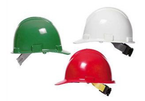
Head & Face Protection