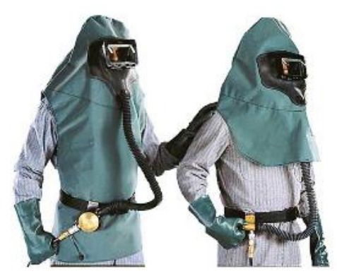
MSA Abrasi-Blast® Blasting Hood