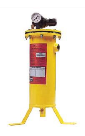
Bullard 41-Series Airline Filters