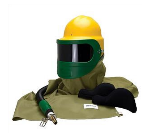
Bullard 88VX Blasting Helmet

Advanced head protection for the harsh exposures of abrasive blasting. Marco offers a wide range of blasting helmets from manufacturers including Bullard®, RPB®, Clemco, and MSA. Additional accessories and blasting helmet packages are also available.