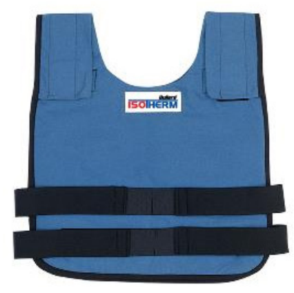
Bullard<sup>®</sup> Isotherm® Cooling Vest

Marco offers a wide variety of body temperature management equipment from manufacturers including Bullard, Clemco, and Air Systems.