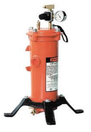
Clemco CPF-Series Airline Filters