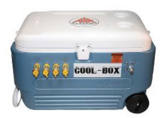
Air Systems<sup>®</sup> Cool-Box™

Bullard<sup>®</sup> DC50 DUAL-COOL™ Cooling Vest System