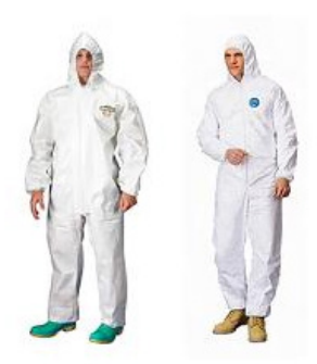
Paint Suits & Protective Clothing