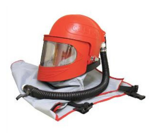
Clemco Apollo 600 Blasting Helmet