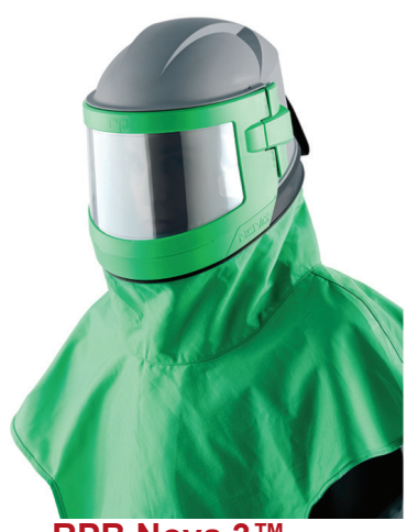
RPB Nova 3™ Blasting Helmet