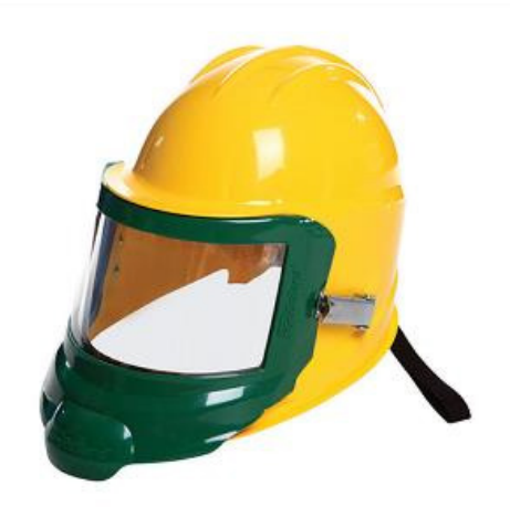
Bullard GenVX™ Blasting Helmet