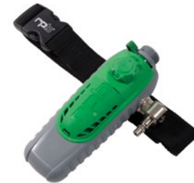
→ C40™ Climate Control Device (SAR)