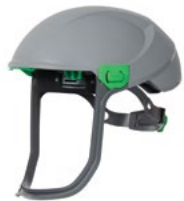
→ T-Link Hard Hat