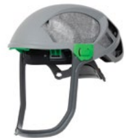
→ T-Link Bump Cap