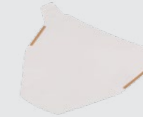
Peel-off Lens Available in packs of 25.