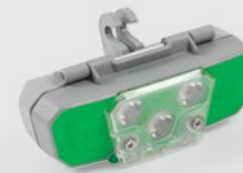
Vision-Link™ 650 lumen helmet lighting system