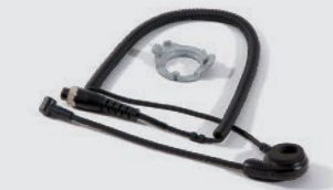
Comms-Link™ In-helmet communication system