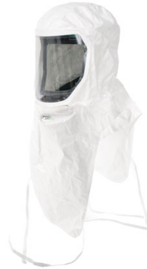
→ Tychem® 4000 Extra Length with Sealed Seams, 0.40 Lens