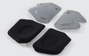
Comfort-Link™ Side padding system Comes standard with CE Headtop.