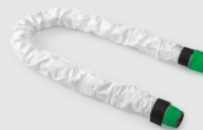
Tychem® Hose Cover Breathing tube not included.