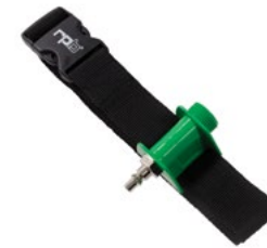
→ Constant Flow Valve (SAR)