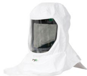
→ Tychem® 2000 with Safety Lens