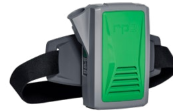
→ PX5® (PAPR)