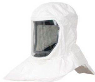
→ Tychem® 4000 with Safety Lens and Sealed Seams