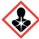
GHS08 Health Hazard