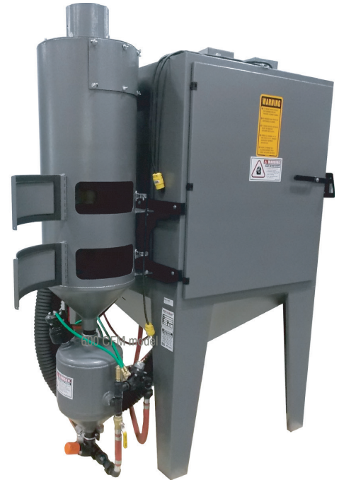
Reclaimers 900 CFM and above are mounted on a stand

All material that passes stage 1 and 2 must pass through a magnetic field where any ferrous particles are trapped. This eliminates possible damage to the substrate being blasted. The magnetic particle separator grill can easily be removed for discarding of collected particles.