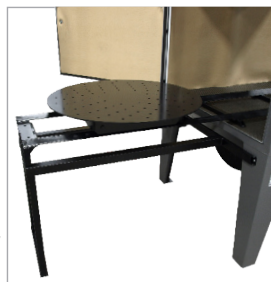
*Custom sizing available.

Available with inside and/or outside track assembly or as set-in turntable only. Standard turntables hold up to 700 lbs, custom turntables hold up to 2000 lbs. Mod-U-Blast® turntable systems will increase worker convenience, comfort and productivity while decreasing glove wear, hand injuries and overall operator fatigue. Ideal for blast cleaning larger, heavier components. May be furnished for one (1) or both (2) sides of the blast cabinet.