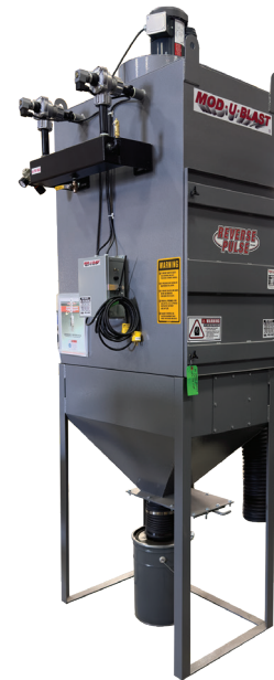
600 CFM model