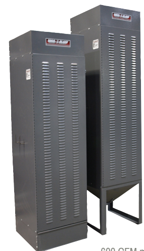
600 CFM model (low profile)