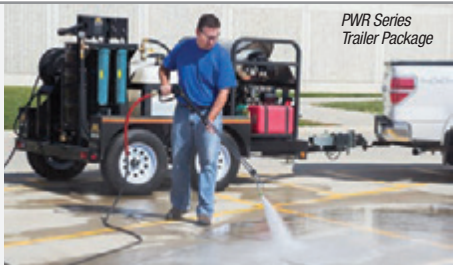
PWR Series Trailer Package