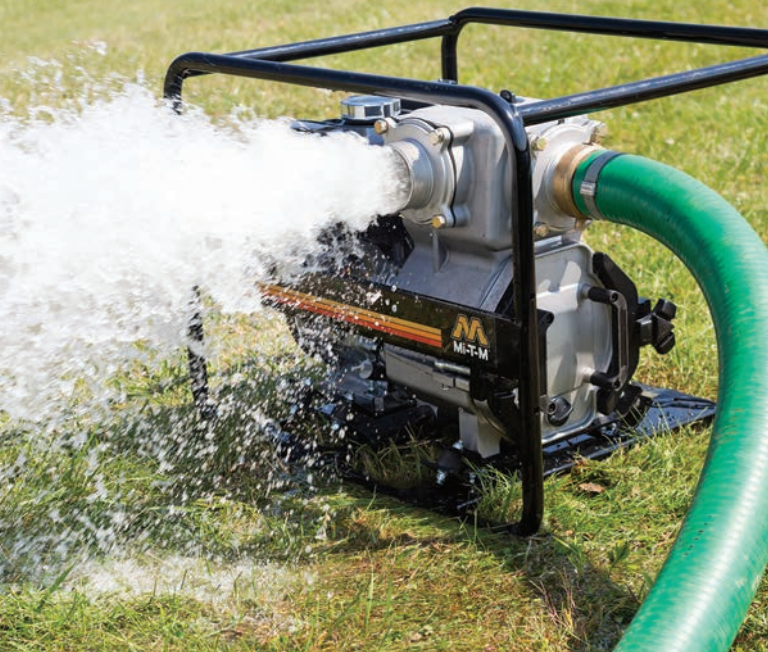
WTP-T03-OMGH shown with 3-inch suction and discharge kit, 70-0525

Built to be extremely durable and easy to transport, these trash pumps quickly remove unwanted water and waste and can handle solids up to 1-inch in diameter. Available in two sizes, they are highly dependable when you need them.