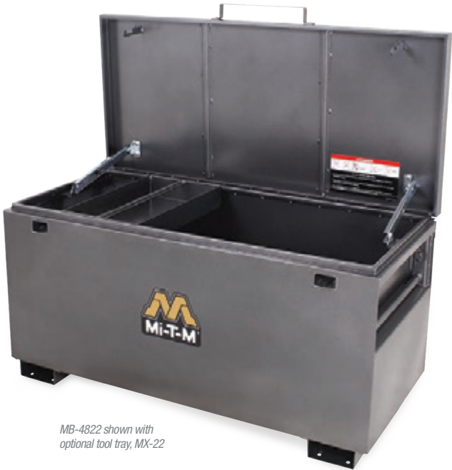
MB-4822 shown with optional tool tray, MX-22

Optimize your tool storage and keep them secure with Mi-T-M jobsite boxes. The heavy-duty, powder coated steel construction makes them a popular choice when looking to protect your investments. Available in several sizes to fit your truck, garage or workshop.