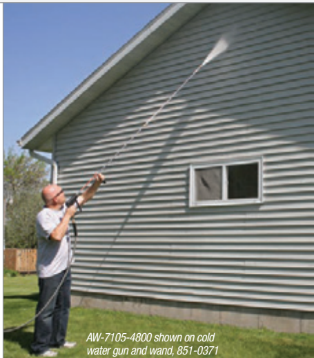
AW-7105-4800 shown on cold water gun and wand, 851-0371