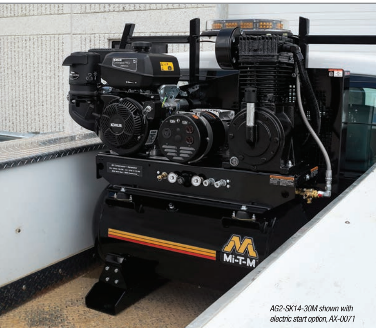
AG2-SK14-30M shown with electric start option, AX-0071

Featuring an industrial air compressor and generator combination, this machine is durable even in the toughest environments. Whether its oil fields or farm fields, this versatile machine will deliver enough power to get the job done.