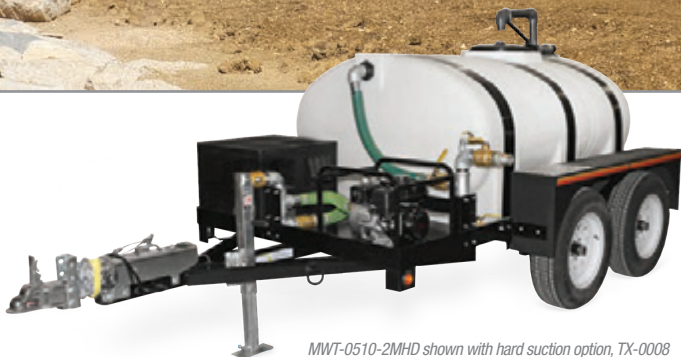
MWT-0510-2MHD shown with hard suction option, TX-0008