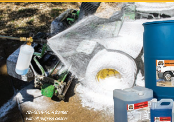
AW-0018-0459 foamer with all purpose cleaner