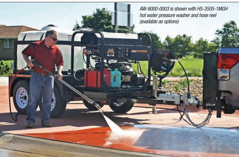
AW-9000-0003 is shown with HS-3505-1MGH hot water pressure washer and hose reel (available as options)

These customizable mobile pressure washer trailers are rugged, convenient and the perfect solution for on-site cleaning. Pair them with an industrial pressure washer to clean dirt and grime anywhere, anytime.