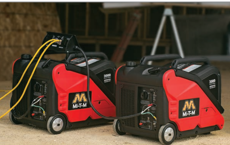
(2) GEN-3000-IMMO shown with parallel port box accessory, AW-5100-0002

Smaller, lighter, quieter and more efficient than conventional generators, the power of a Mi-T-M inverter generator is ultra-clean and can be used to power sensitive electronic equipment like smartphones, tablets, computers and medical devices.