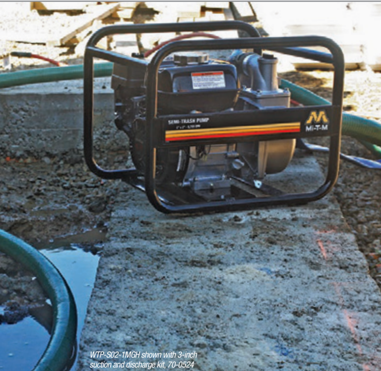
WTP-S02-1MGH shown with 3-inch suction and discharge kit, 70-0524

The compact, lightweight and portable Mi-T-M 2-inch semi-trash pump is an excellent choice for homeowners, hobby farmers, contractors or anyone who needs to remove water quickly and efficiently. This pump can handle solids up to 3/4-inch.