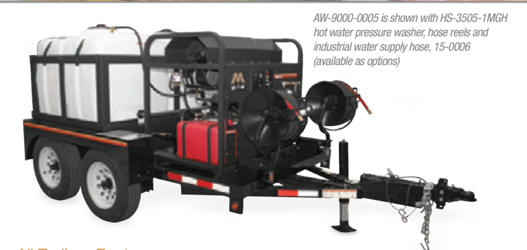
AW-9000-0005 is shown with HS-3505-1MGH hot water pressure washer, hose reels and industrial water supply hose, 15-0006 (available as options)