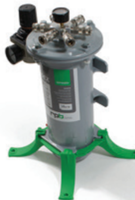
RPB Radex® Airline Filters