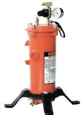
Clemco CPF-Series Airline Filters