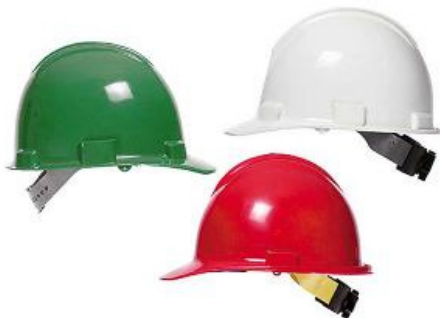
Head & Face Protection