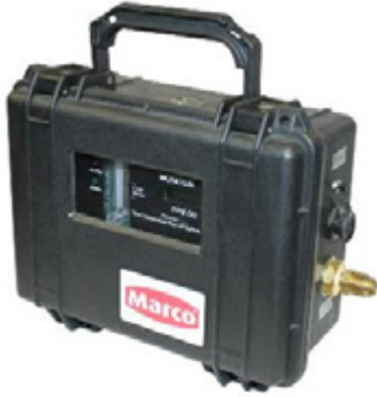
Barricade® Carbon Monoxide Monitors

A carbon monoxide monitor continuously samples compressed breathing air to alert operators to the presence of harmful carbon monoxide (CO), an odorless, tasteless, colorless gas. Marco offers a variety of CO Monitors with audio and visual alarms to notify operators when CO levels exceed the allowable level, as required by OSHA 29CFR 1910.134.