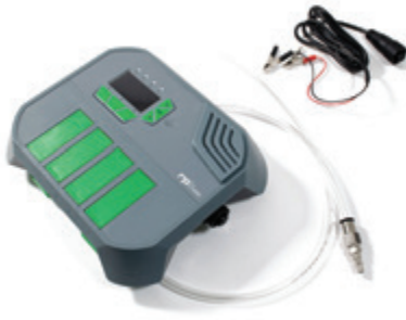
RPB® GX4® Gas Monitors