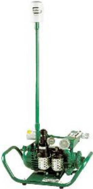
Bullard ADP20 Free-Air Pump

Marco offers a wide variety of ambient air pumps from Bullard to increase productivity and enhance safety. Ambient air pumps supply air for air-fed respirators approved to operate at 15 psi or less. Grade D breathing-air input required.