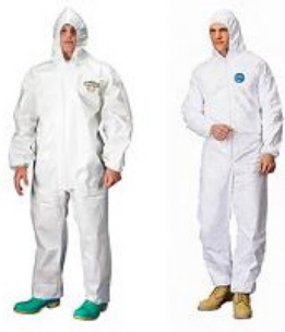
Paint Suits & Protective Clothing