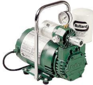
Bullard EDP10 Free-Air® Pump