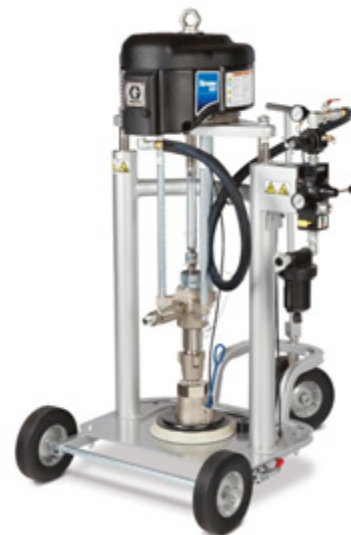
Graco® Xtreme® Passive Fire Protection Single Component Sprayer