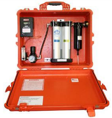
MST® Respiratory Protector