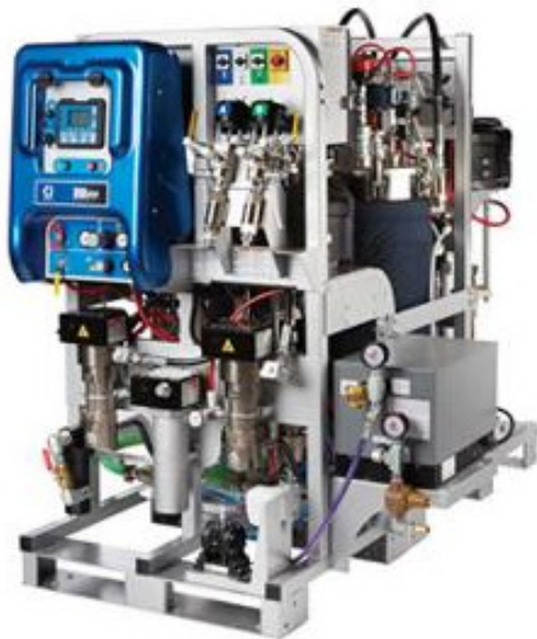
Graco® XM™ Passive Fire Protection Sprayer

Passive Fire Protection (PFP) coatings make structures more resistant to fire by insulating structural steel from high temperatures and as a result, buy time for the evacuation before structural collapse. Marco offers a wide variety of Graco® Passive Fire Protection Sprayers for multiple applications.