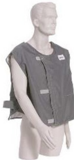
Air Systems® Cool-Box™