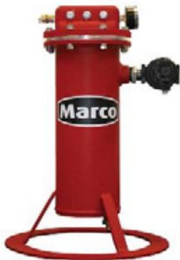
Barricade® 286-Series Airline Filters

Marco offers a wide variety of airline filters from manufacturers including Marco, Bullard®, RPB®, and Clemco. Airline filters remove particulates like oil, odor, and organic vapors from compressed air before delivery to a supplied-air respirator.