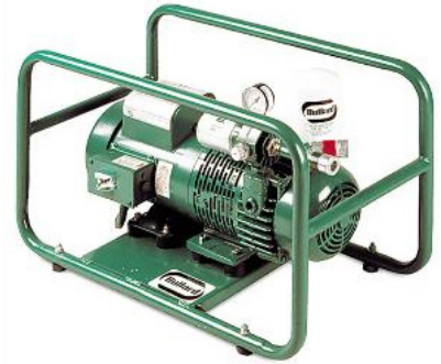
Bullard EDP16TE Free-Air Pump