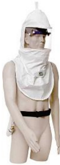
Bullard® Supplied-Air Painting Respirators