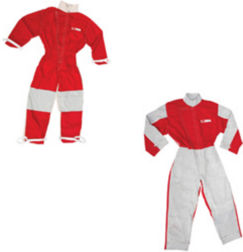
Blastmaster® Abrasive Blasting Suits

Blastmaster® Abrasive Blasting Suits are made with high quality material to keep you safer and more comfortable during all of your blasting jobs.