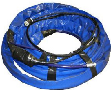
Electric and Hot Water Heated Hose Bundles

Marco offers a wide variety of special order and in-stock plural component spray system accessories.