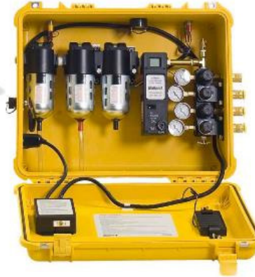
Bullard® Breather Boxes