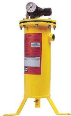
Bullard 41-Series Airline Filters