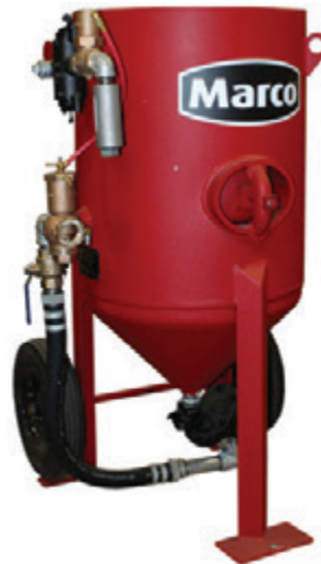
Blastmaster® 6.0, 3.0 & 1.0 Cu. Ft. C-Series Abrasive Blasting Pots