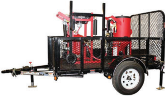
Abrasive Blasting System - Trailer-Mounted

By packaging a high performance abrasive blasting system on a trailer or skid, Marco has created high production abrasive blasting systems with unmatched portability and versatility. These systems combine an abrasive blasting pot, moisture management system, and a 6-Outlet airline filter together on a skid or trailer for ease of portability. Typical applications include blast rooms, blast yards, oil refineries, and pipelines. Common abrasives used include garnet, mineral abrasives, and slags.