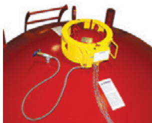
Camlock Closure Lockout Device