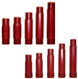
Blastmaster® Silicon Carbide All Poly Nozzle

Having the right nozzle for the job increases production rates. Marco stocks a wide variety of nozzles to meet your specific job requirements. With the largest inventory of nozzles available in North America, Marco will ship in-stock orders the same day your order is placed, preventing downtime and keeping your job on schedule.