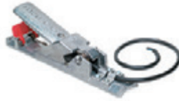
Blastmaster® 151E Remote Control Switch