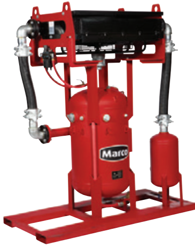
Blastmaster® 1600 CFM Aftercooler with Coalescing Tank

Marco offers a complete line of moisture management systems that provide efficient moisture management solutions to keep your equipment running at peak performance.