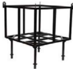
Blastmaster® Offshore Bulk Bag Rack