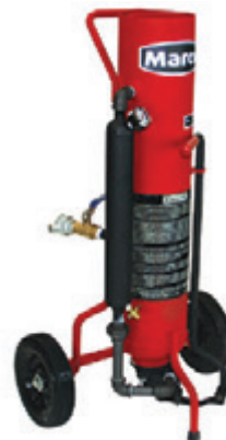
Blastmaster® 2.0, 1.5 & 0.35 Cu. Ft. L-Series Abrasive Blasting Pots