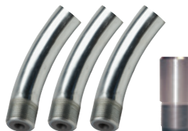
Blastmaster® Banana Nozzle