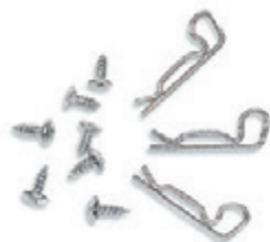
Coupling Screws and Safety Clips