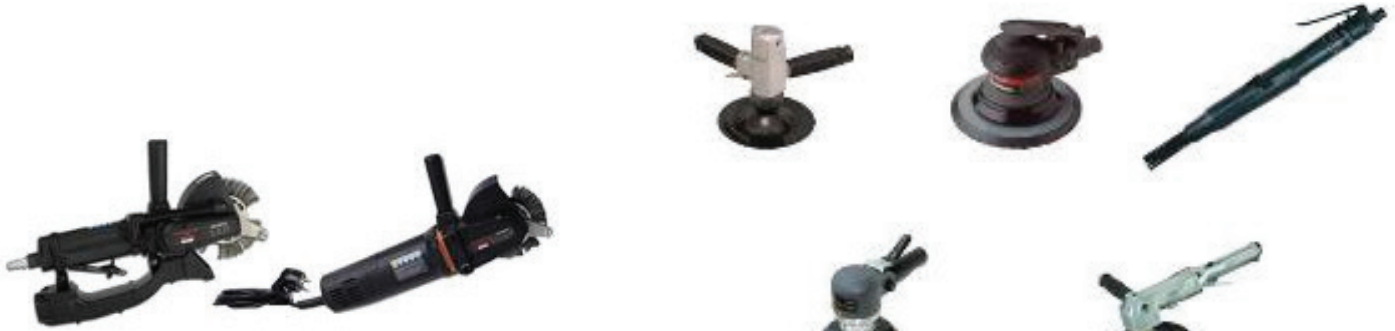
MBX® Bristle Blaster®

Marco's line of surface preparation power tools give you the right equipment to power through tough jobs. We have what you need including needle scalers, peening preparation tools, grinders, sanders and bristle blasters.