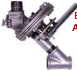
Blastmaster® Regulator Abrasive Metering Valve