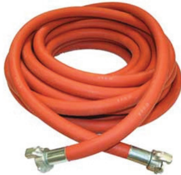
Blastmaster® Air Hose

Marco's industrial air hose is perfect for conveying compressed air over long distances to air operated equipment, such as abrasive blasting pot and airless paint spray pumps.