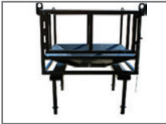
Blastmaster® Heavy-Duty Bulk Bag Rack