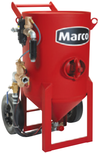
Blastmaster® 6.5 & 3.5 Cu. Ft. M-Series Abrasive Blasting Pots

Abrasive blasting pots are the right equipment for large to small scale industrial and contractor abrasive blasting projects. Abrasive blasting pots are available in a wide range of capacities and can allow up to four operators at a time to perform abrasive blasting for an extended period of time.