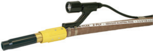
Blastmaster® 300 Series Hose-Mounted Light

Marco offers a full line of lighting options. Hose mounted abrasive blasting lights provide direct lighting to the surface being blasted. Hazardous location lights provide direct lighting to your work area.