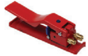
Blastmaster® 152P Remote Control Switch