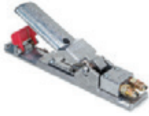
Blastmaster® 150P Remote Control Switch

With a Marco remote control switch, you can remotely activate and deactivate the abrasive blasting pot. All of our switches are OSHA compliant and provide a “fail-to-save” design. Choose a pneumatic or electric switch.