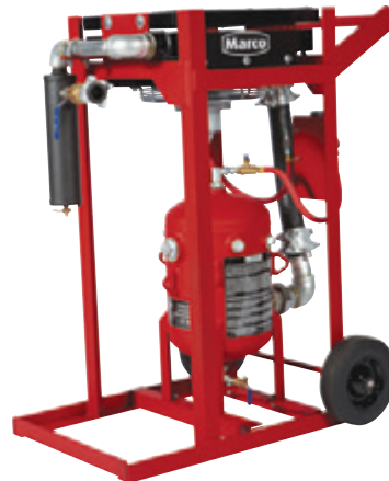
Blastmaster® 250 CFM Cart Mounted Aftercooler with Moisture Separator