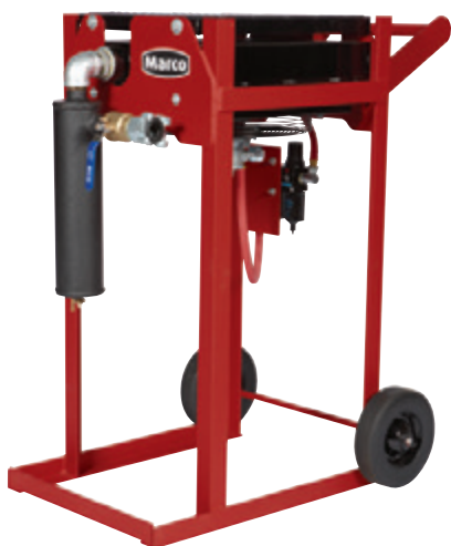
Blastmaster® 400 CFM Cart Mounted Aftercooler