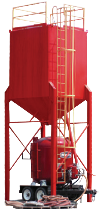
725 Cu. Ft. Abrasive Storage Hopper

An economical option for storing and loading bulk abrasive, the 725 Cu. Ft. Abrasive Storage Hopper keeps abrasive off the ground and out of the elements, protecting the abrasive from moisture contamination.