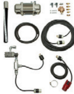
Blastmaster® 123E Remote Control System