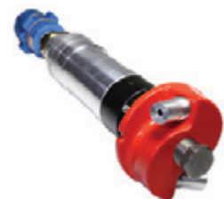
Blastmaster® Tornado Internal Pipe Blasting Tool