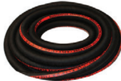
Blastmaster® Xtreme-Duty® Abrasive Blasting Hose