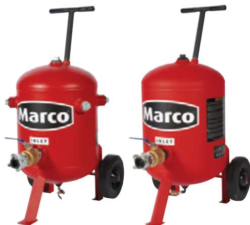
Blastmaster® 1600 CFM Moisture Separator