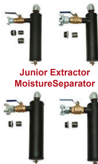
Junior Extractor Moisture Separator