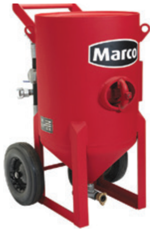
Blastmaster® 6.5 & 3.5 Cu. Ft. S-Series Abrasive Blasting Pots