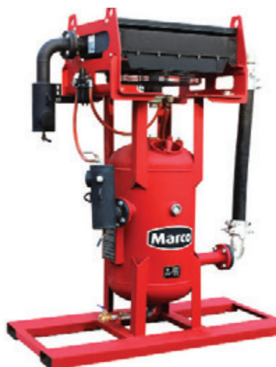
Blastmaster® 950 CFM Air Dryer