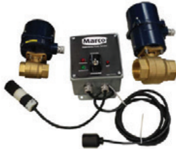
Blastmaster® Automated Depressurization System

Marco offers a wide variety of abrasive blasting pot accessories to increase productivity and enhance safety. Abrasive blasting pot accessories can be used on the complete range of abrasive blasting pot sizes Marco has available.