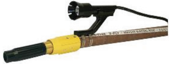
Blastmaster® 301 Series Hose-Mounted Light