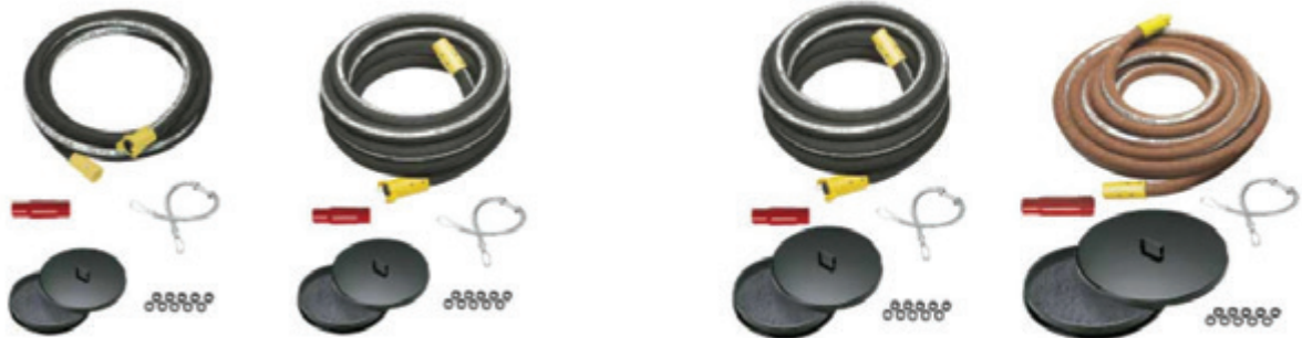
Abrasive Blasting Pot Packages