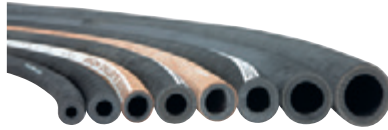
Sizes Available from 1/2" I.D. to 2" I.D.