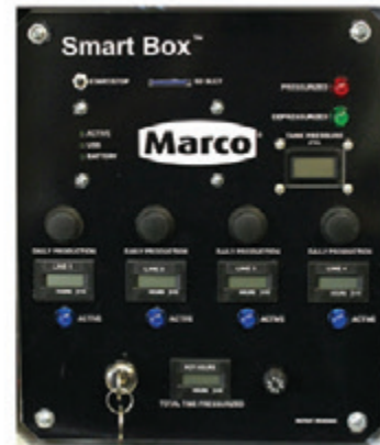
Blastmaster® Smart Box™ Production Management System