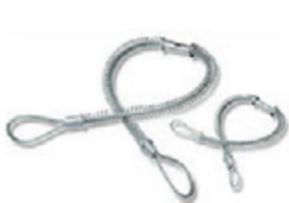
Whip Check Safety Cables