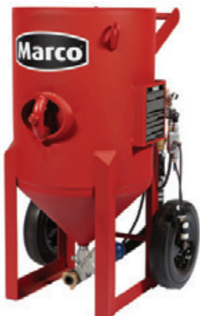
Blastmaster® 6.5 & 3.5 Cu. Ft. HP-Series Abrasive Blasting Pots