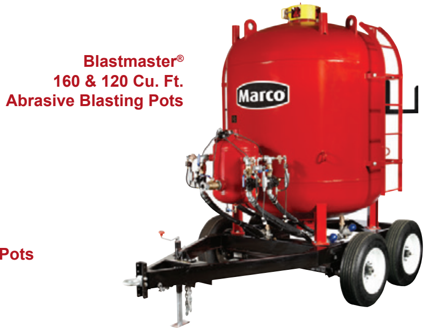
Blastmaster® 160 & 120 Cu. Ft. Abrasive Blasting Pots