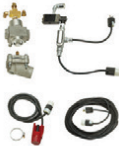
Blastmaster® 120E Remote Control System

With a Marco Remote Control System, you can remotely activate and deactivate the abrasive blasting pot. All of our remote control systems are OSHA compliant and provide a “fail-to-safe” configuration.