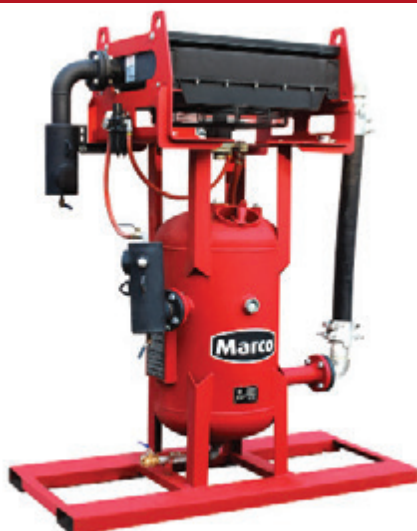
Blastmaster® 1600 CFM Air Dryer