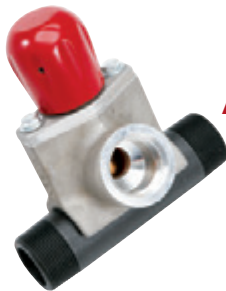
Blastmaster® Bantam Abrasive Metering Valve

Marco offers a wide selection of abrasive metering valves that regulate the amount of abrasive that enters the air stream. These abrasive metering valves give you the variable and instant abrasive control for great results on every work site.