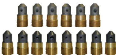
Blastmaster® Angle Nozzle