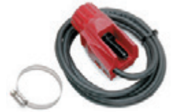
Blastmaster® 156P Remote Control Switch