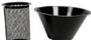
Blastmaster® Abrasive Screen and Funnel