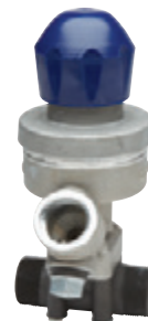
Blastmaster® Maxum III Abrasive Metering Valve