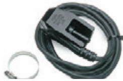
Blastmaster® 155E Remote Control Switch