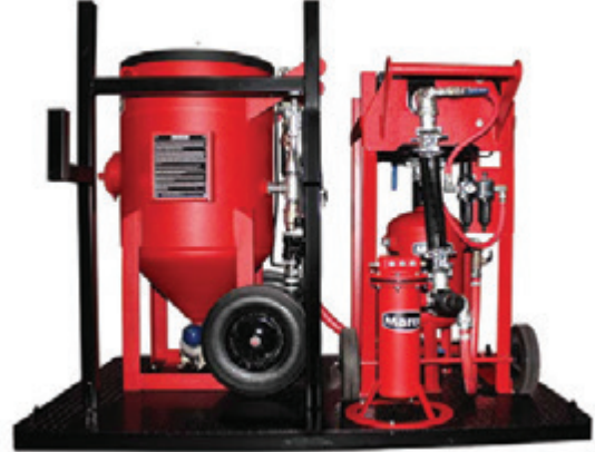
Abrasive Blasting System - Skid-Mounted