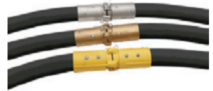
Custom Couplings and Nozzle Holders Installation