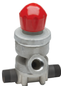
Blastmaster® Maxum I Abrasive Metering Valve