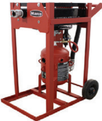
Blastmaster® 400 CFM Cart Mounted Aftercooler with Moisture Separator