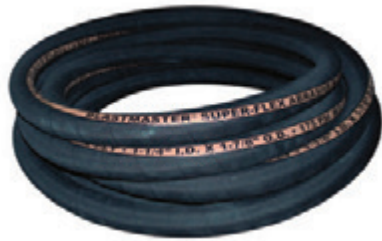
Blastmaster® Super-Flex Abrasive Blasting Hose

When it comes to abrasive blasting hose, choose the industry leader. No one sells or stocks more abrasive blasting hose than Marco. Marco offers different types of abrasive blasting hose to meet the needs of a wide array of applications. Whether you require 10 ft. or 10,000 ft. of abrasive blasting hose, Marco is prepared to ship the abrasive blasting hose the same day your order is placed.