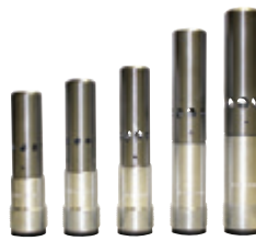
Blastmaster® Double Venturi Nozzle