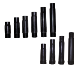
Blastmaster® Tungsten Carbide All Poly Nozzle