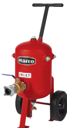
Blastmaster® 800 CFM Moisture Separator