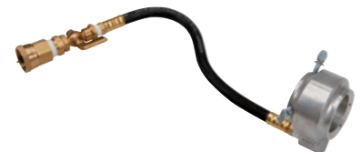
Blastmaster® Water Ring