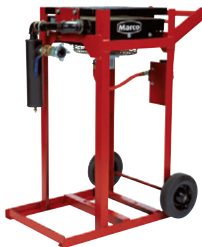
Blastmaster® 250 CFM Cart Mounted Aftercooler