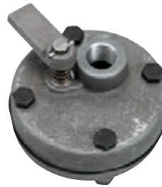
Blastmaster® Regulator Jr. Abrasive Metering Valve