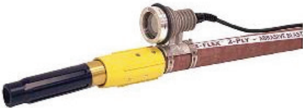
Blastmaster® 307 Series Hose-Mounted Light