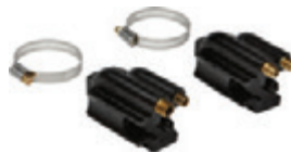
Blastmaster® 158P Remote Control Switch