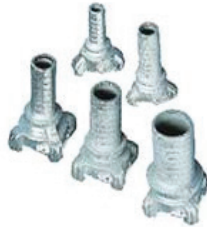
Hammer Lock Fittings Swivel Couplings & Gaskets Threaded Metal End Couplings & Gaskets