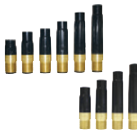
Blastmaster® Tungsten Carbide Brass/Poly Nozzle