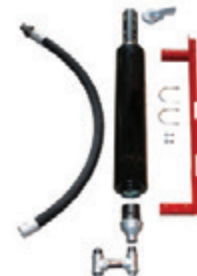
Abrasive Blasting Pot Muffler