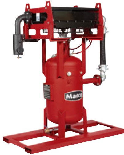
Blastmaster® 950 CFM Aftercooler with Coalescing Tank