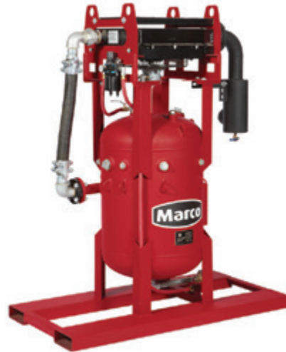
Blastmaster® 400 CFM Aftercooler with Coalescing Tank