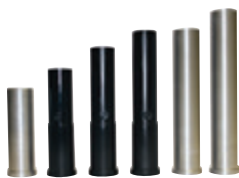
Blastmaster® Flanged Nozzle