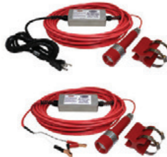
Blastmaster® 308 Series LED Hose-Mounted Light