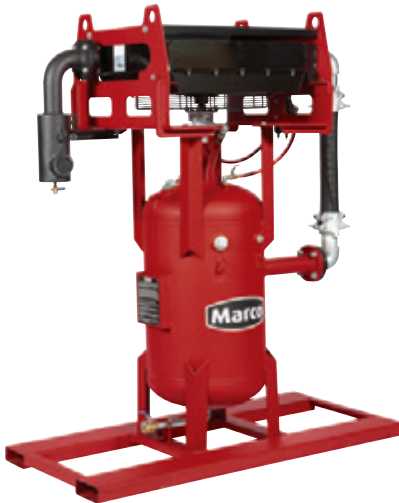
Blastmaster® 750 CFM Aftercooler with Coalescing Tank