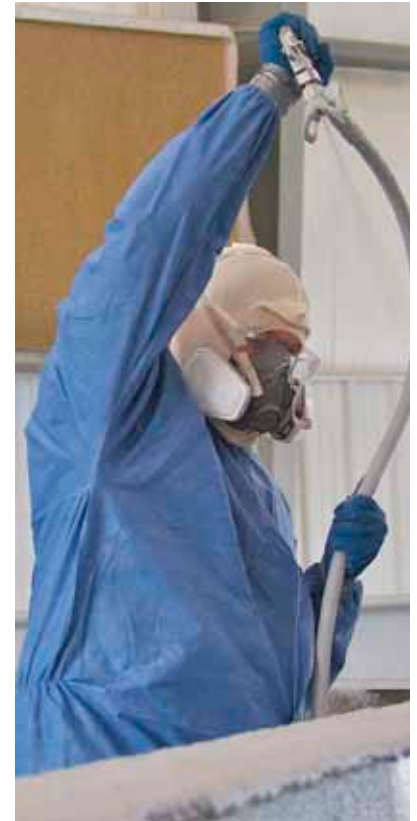
Applying passive fire protection material to steel beams.