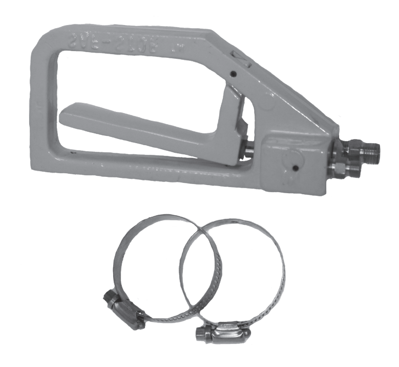
Figure 2: Empire Saf-Stop II Electric Remote Control Switch