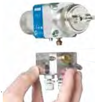
Compact Automatic X

All the features of the Compact Automatic "I" plus fast & easy removal from the mounting block.