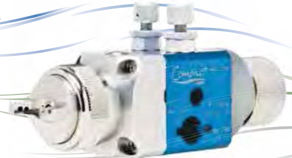
Compact Automatic I

Available in Trans-Tech, HVLP and Advanced Conventional