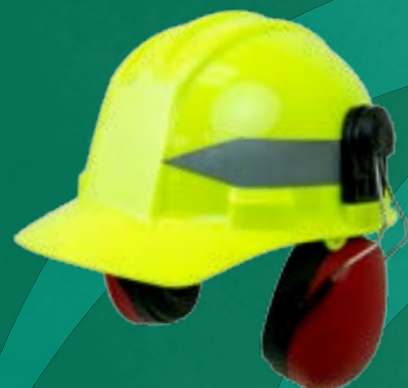
Model S51 with hearing protection