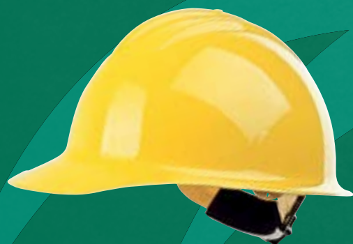
Model 911C (cap style)