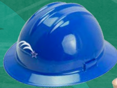
Model C35 (extra-large full-brim with accessory slots)