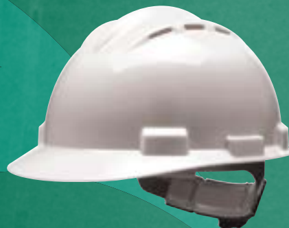
Model S62 (vented cap style)