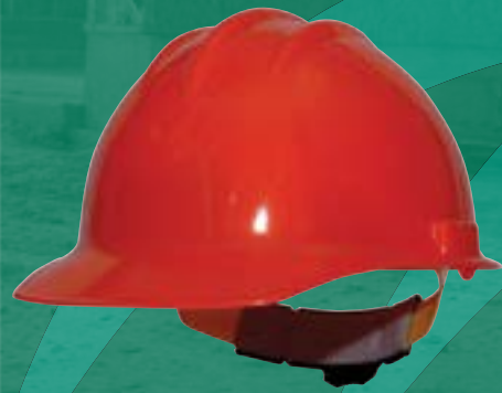
Model C30 (cap style)