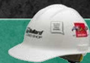
Bullard Logo Shop