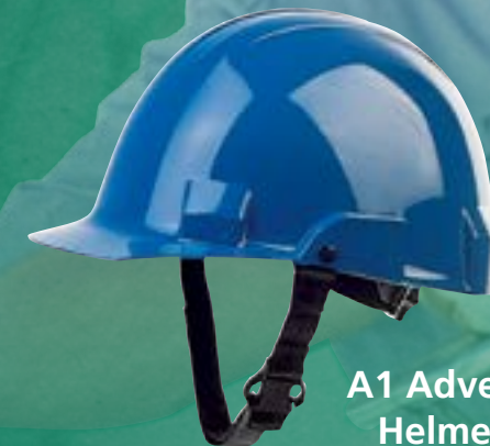
A1 Advent Helmet (with 2-point chinstrap)