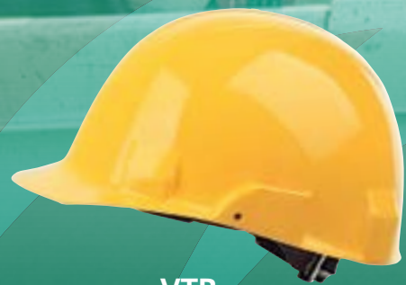
VTR (with ratchet suspension)