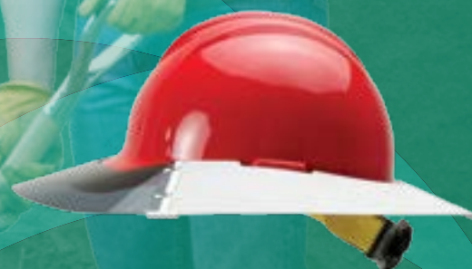
Model SS5 Sunshield