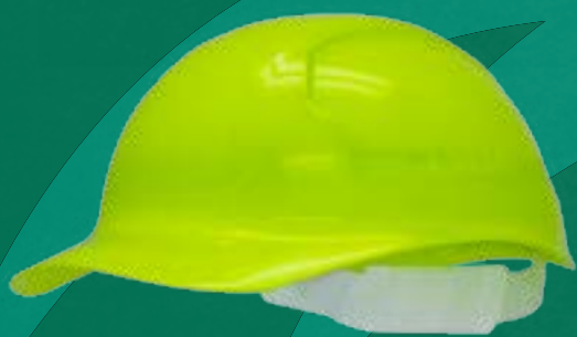
Bullard Bump Cap