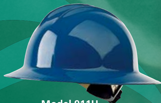
Model 911H (full-brim)