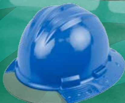
Model AVRG (grey tint visor)