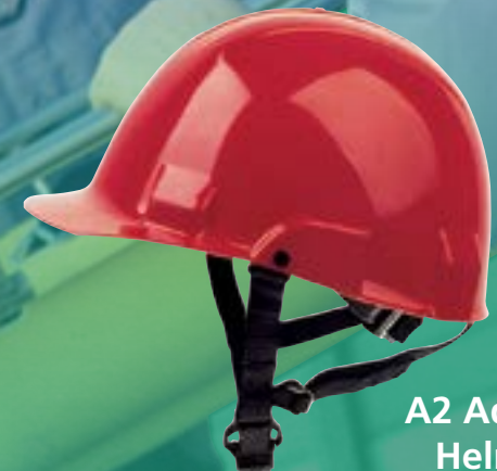
A2 Advent Helmet (with 3-point chinstrap)