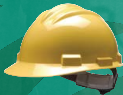
Model S61 (cap style)