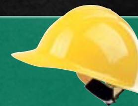
High Heat Series