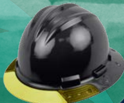
Model AVRY (yellow tint visor)