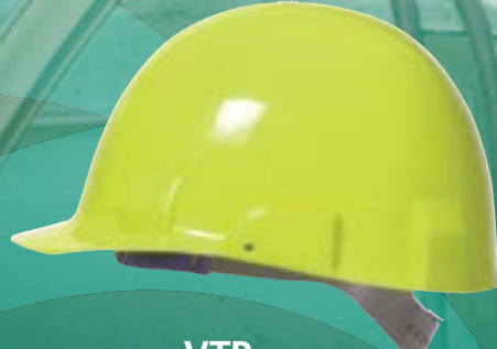
VTP (with pinlock suspension)