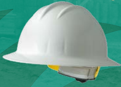
Model C34 (extra-large full-brim)