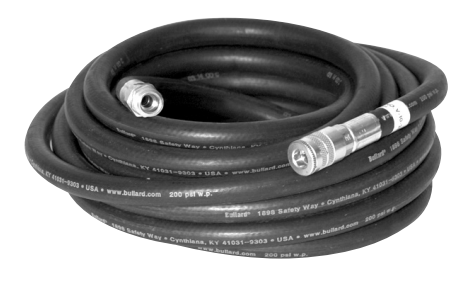
10B4696 (Starter Hose)