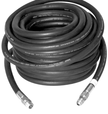
10B5454 10B5457 10B5458