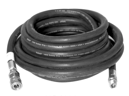
10B46915 (Starter Hose)