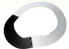
SS5 Sun Shield