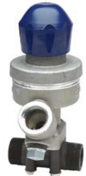
BLASTMASTER® MAXUM III ABRASIVE METERING VALVE