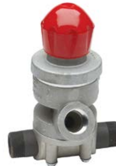
BLASTMASTER® MAXUM ABRASIVE METERING VALVE