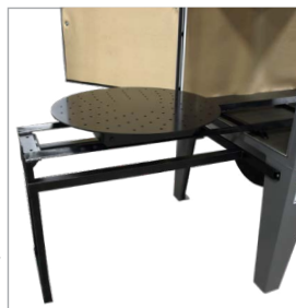
*Custom sizing available.

Available with inside and/or outside track assembly or as set-in turntable only. Standard turntables hold up to 700 lbs, custom turntables hold up to 2000 lbs. Mod-U-Blast® turntable systems will increase worker convenience, comfort and productivity while decreasing glove wear, hand injuries and overall operator fatigue. Ideal for blast cleaning larger, heavier components. May be furnished for one (1) or both (2) sides of the blast cabinet.