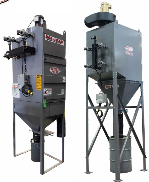
600 CFM model