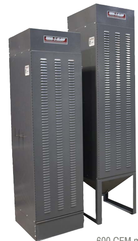
600 CFM model (low profile)