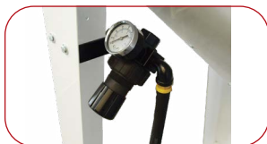
AIR REGULATOR / GAUGE

Coated neoprene glove with fold-sewn vinyl sleeve and grip coat.