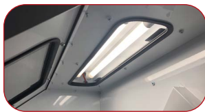
EXTERNAL LED LIGHTING SYSTEM.

E-Series machines are economical and state-of-the-art, at a price any shop can afford. E-Series blast cabinets come standard with industrial quality, rugged components typically found only on higher production machines. E-Series blast cabinets are designed for use with glass beads and can tackle a wide variety of projects. This series is very popular in the automotive industry and any other environment where consistent, professional results are needed with a minimal up front cost.