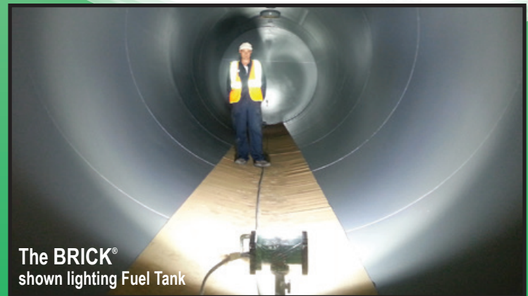
The BRICK® shown lighting Fuel Tank