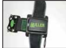
Label Pack: Polypropylene, Santoprene