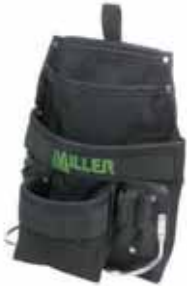
Multi-pocket Tool Bag