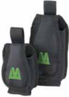
Cell Phone Holders (two sizes)