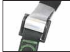
Cam-Buckle: Polyester, Nylon