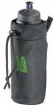
Water Bottle Holder