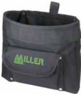
2 Pocket Nail & Tool Pouch