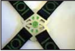
PivotLink: Aluminum, Polypropylene, Stainless Steel