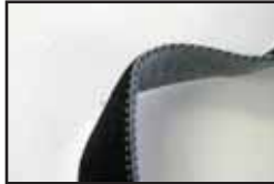
TechWeb: Polyester, Nylon