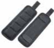
Pads (Belt, Shoulder, Back): Polyester, Nylon