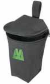
Zippered Cylindrical Utility Pouch