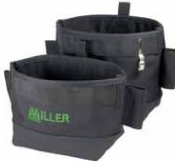
Open Bolt and Bull Pin Bags

For more information or to purchase accessories, contact your Miller distributor or Miller Customer Service at 1-800-873-5242.